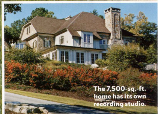
The 7,500-sq.-ft. home has its own recording studio.